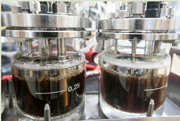
Plant feedstocks being broken down into useful products at the GLBRC.

"If we want to think about bigger, higher-level policy questions, we need to consider the selection of types and locations of lands, the selection of promising target fuels and chemicals, as well as incentives for farmers," says Maravelias. "That's why we're marrying plant and ecological system modeling with biorefinery models."