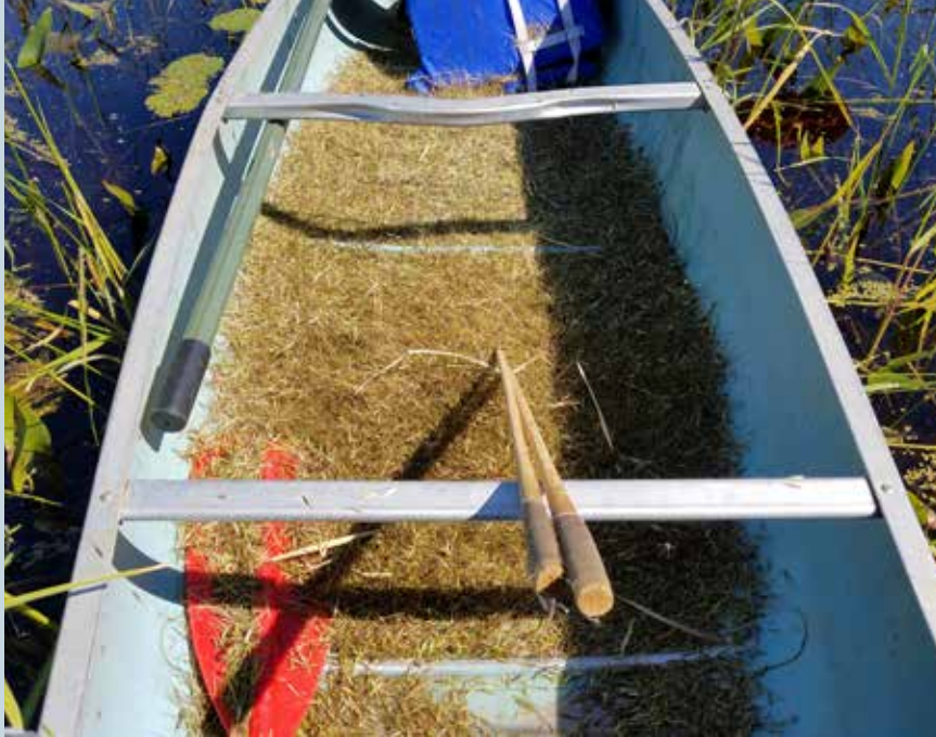
A canoe filled with wild rice—along with the knockers used to harvest it—after a ricing trip on the Lac du Flambeau Reservation.