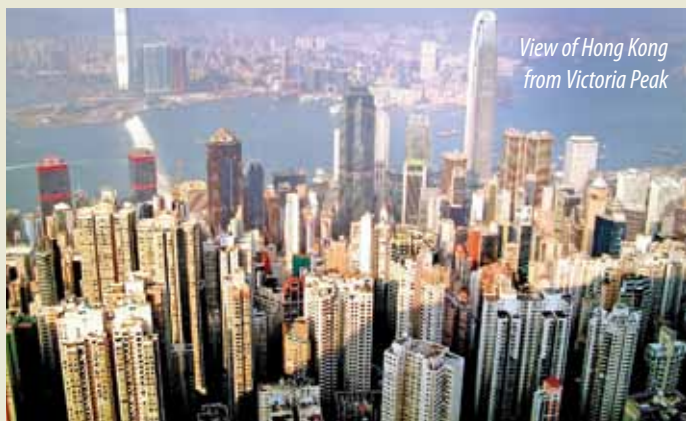
View of Hong Kong from Victoria Peak