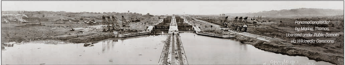
"Panama Canal 1913a"